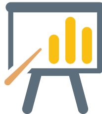
General Data Protection Regulation (GDPR)