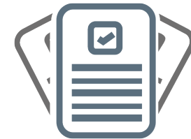
WallPost ERP Software Solution