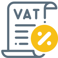
VAT Registration and Compliance